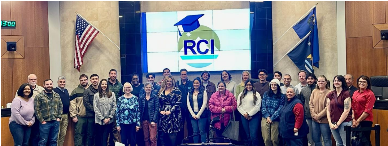
Reno Constituents Institute (RCI) 2026 Cohort